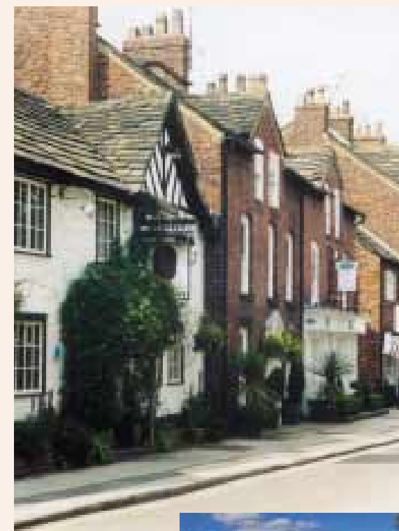
Prestbury village.