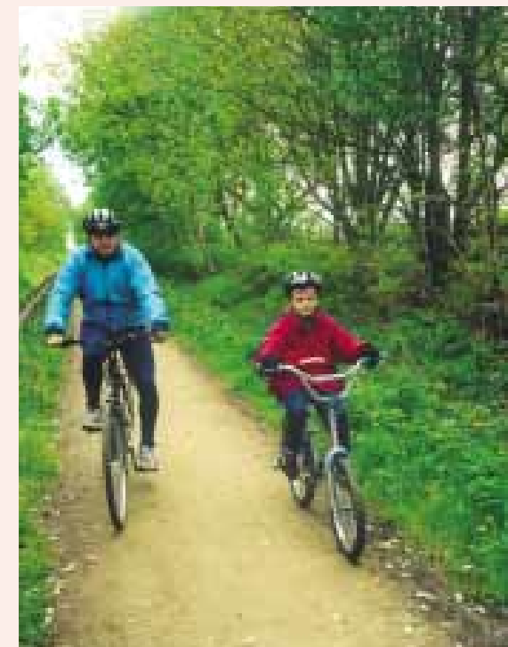
Cyclists on the Trans Pennine Trail.