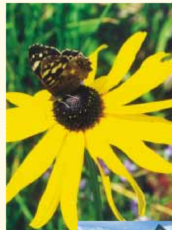
Speckled Wood butterfly basking.