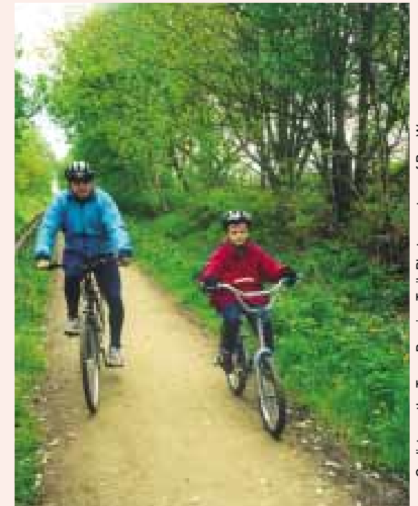
Cyclists on the Trans Pennine Trail.