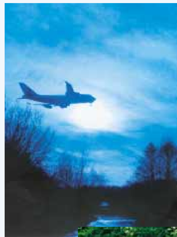
Coming into land over the River Bollin.