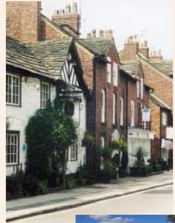
Prestbury village.